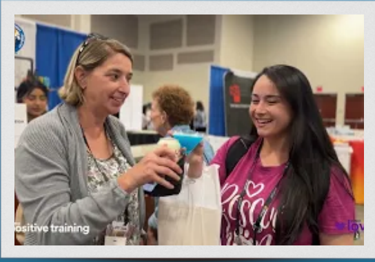
APDT 2024 Conference in Riverside, California