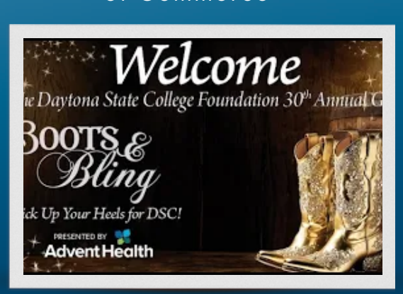
Daytona State College Foundation 30th Annual Gala