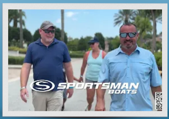
Atlantic Marine's Sportsman Ride Before You Buy Event