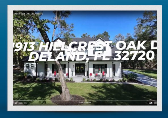
1913 HILLCREST OAK DR DELAND, FL