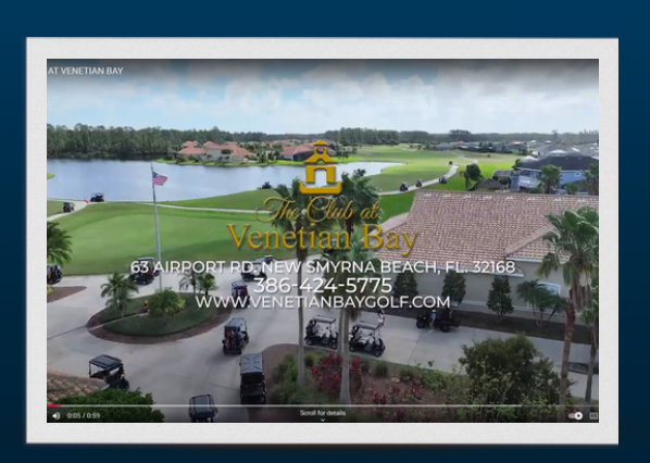
THE CLUB AT VENETIAN BAY