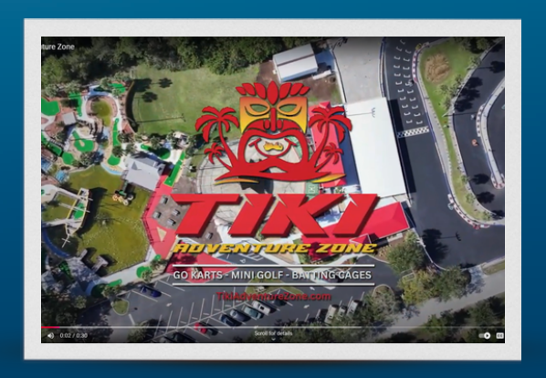
TIKI ADVENTURE ZONE