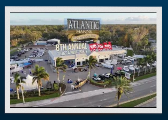
Atlantic Marine 8th Annual Toys for Tots Stuff a Boat Party