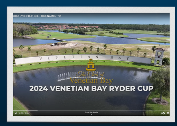
VENETIAN BAY RYDER CUP GOLF TOURNAMENT VI