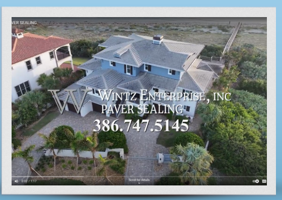
WINTZ PAVER SEALING