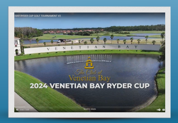
VENETIAN B V2AY RYDER CUP GOLF TOURNAMENT