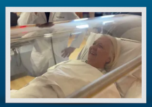
Halifax Health Introduces New Hyperbaric Chamber