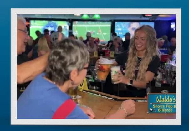
Waldo's Sports Bar TV Commercial